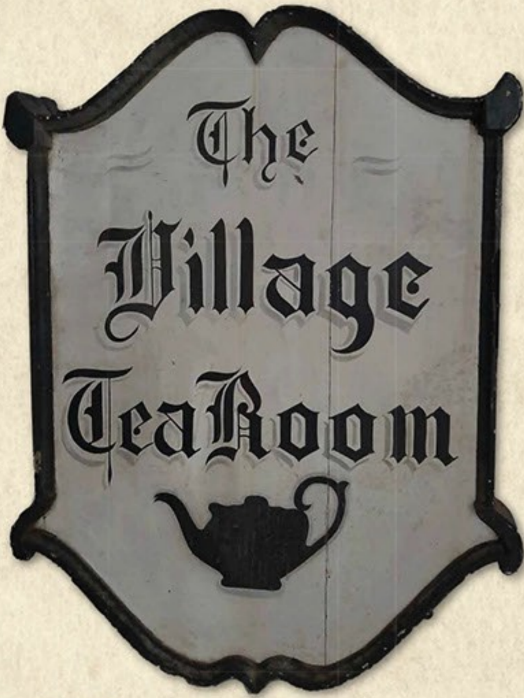
Village Tea Room